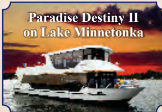
Paradise Destiny II on Lake Minnetonka

☆ Accommodations for groups from 10-145 ☆