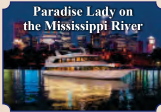
Paradise Lady on the Mississippi River