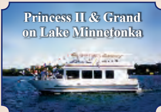
Princess II & Grand on Lake Minnetonka