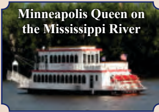
Minneapolis Queen on the Mississippi River

A Private Charter aboard our award winning fleet is ideal for: