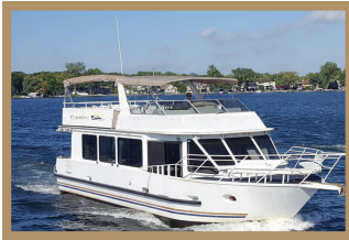
Paradise Princess II on Lake Minnetonka