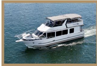
Paradise Grand on Lake Minnetonka