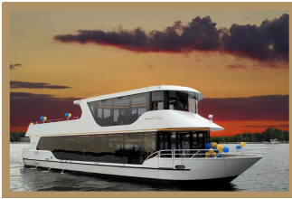
Paradise Destiny II on Lake Minnetonka

Cruise Lake Minnetonka or the Mississippi River Accommodations for groups from 10-125 passengers.