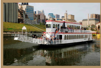
Minneapolis Queen on The Mississippi River