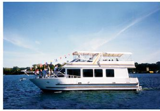
Princess II & Grand on Lake Minnetonka