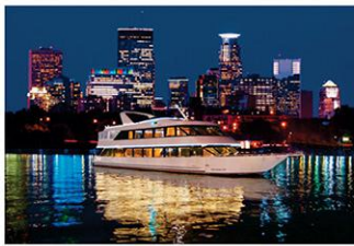
Paradise Lady on The Mississippi River