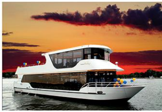
Paradise Destiny II on Lake Minnetonka

On The Majestic Mississippi River and Beautiful Lake Minnetonka