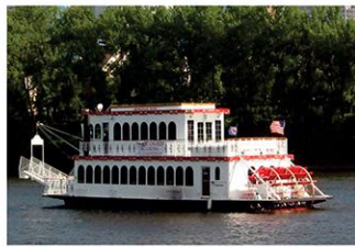
Minneapolis Queen on The Mississippi River

A Private Charter aboard our award winning fleet is ideal for: